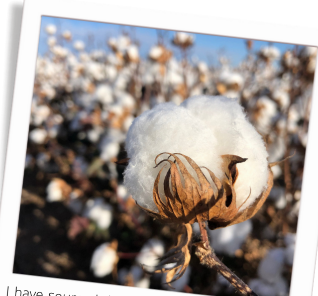
I have sourced the most <u>luxurious long staple</u> <u>Cotton produced in Australia</u>, and it's grown on an Eco-Biz certified farming operation!

Made of safe and renewable fibres Made to be used more Zeduce waste